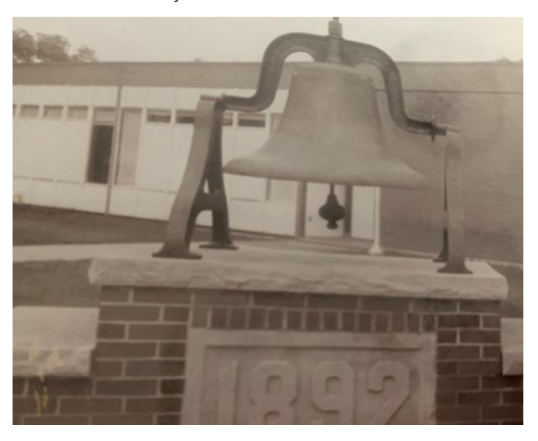
1970s photo of the bell at the corner of Tremont Grade School